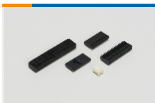
Wire-to-Board Connector Assemblies & Housings(53)