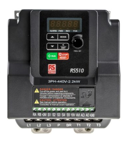
0.75KW Three phase picture