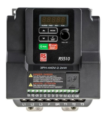
0.75KW Three phase picture