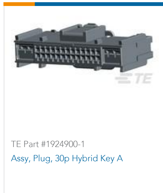
TE Part #1924900-1 Assy, Plug, 30p Hybrid Key A