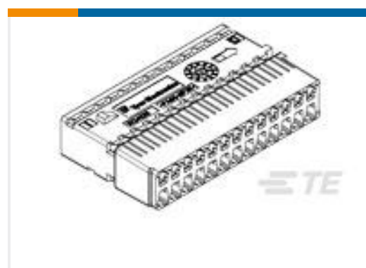
TE Part #1924136-2 Carrier, 26P Generation Y, 52P Conn