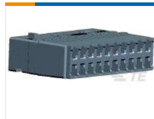
TE Part #2098634-1 Carrier, 20P, GY LAC, Black