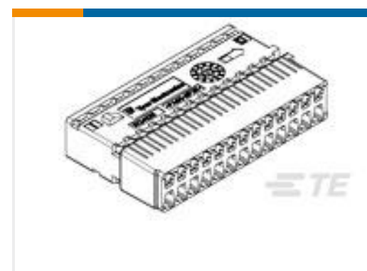
TE Part #1924136-1 Carrier, 26P Generation Y, 52P Conn