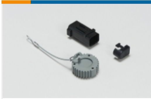
Automotive Connector Caps & Covers (16)