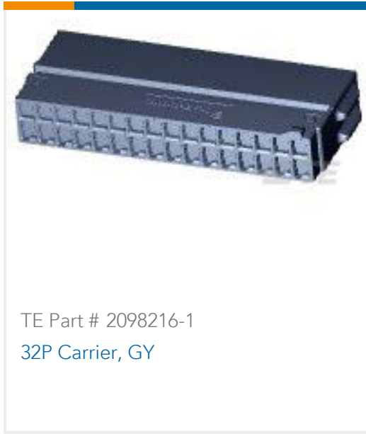
TE Part # 2098216-1 32P Carrier, GY