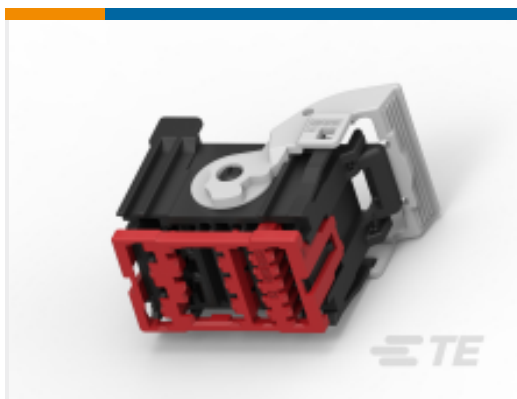
TE Part #2098627-1 22P UNSEALED HYBRID PLUG ASSEM