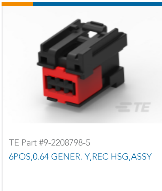
TE Part #9-2208798-5 6POS,0.64 GENER. Y,REC HSG,ASSY