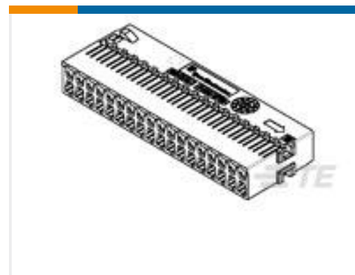
TE Part #1924340-1 36P, 2 Row Carrier for 54P LAC