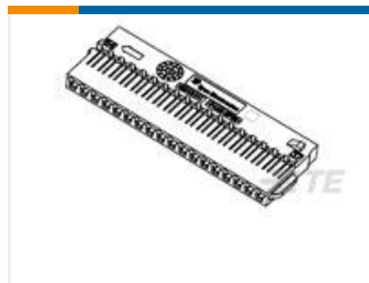
TE Part #1924341-1 18P, 1 Row Carrier for 54P LAC