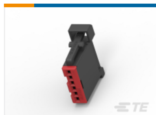
TE Part #2272431-3 1X6 GET UNSLD SIDE LATCH PLUG, KEY C