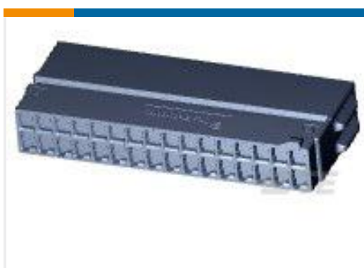
TE Part #2098216-1 32P Carrier, GY