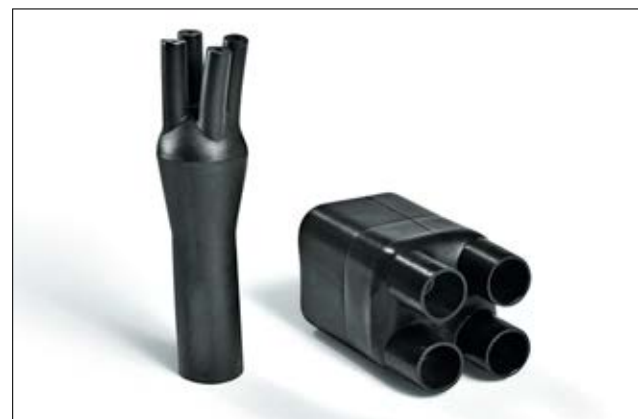
400 series supplied / fully recovered.