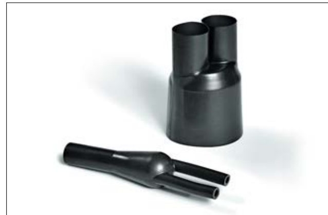
223-2 supplied / fully recovered.