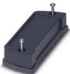
Panel mounting base, length: 15 mm, Side part, color: gray, width: 101.9 mm, height: 36.2 mm

Please be informed that the data shown in this PDF Document is generated from our Online Catalog. Please find the complete data in the user's documentation. Our General Terms of Use for Downloads are valid ( http://phoenixcontact.com/download )