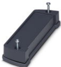
Panel mounting base, length: 15 mm, Side part, color: gray, width: 124.4 mm, height: 36.2 mm

Please be informed that the data shown in this PDF Document is generated from our Online Catalog. Please find the complete data in the user's documentation. Our General Terms of Use for Downloads are valid ( http://phoenixcontact.com/download )