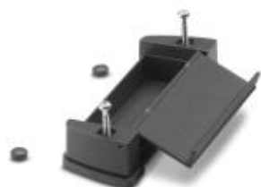
Panel mounting base, length: 15 mm, Side part, color: gray, width: 101.9 mm, height: 36.2 mm

Please be informed that the data shown in this PDF Document is generated from our Online Catalog. Please find the complete data in the user's documentation. Our General Terms of Use for Downloads are valid ( http://phoenixcontact.com/download )