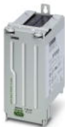
Energy storage device, lead AGM, VRLA technology, 24 V DC, 3.4 Ah, tool-free battery replacement, automatic detection, and communication with QUINT UPS-IQ

Please be informed that the data shown in this PDF Document is generated from our Online Catalog. Please find the complete data in the user's documentation. Our General Terms of Use for Downloads are valid ( http://phoenixcontact.com/download )