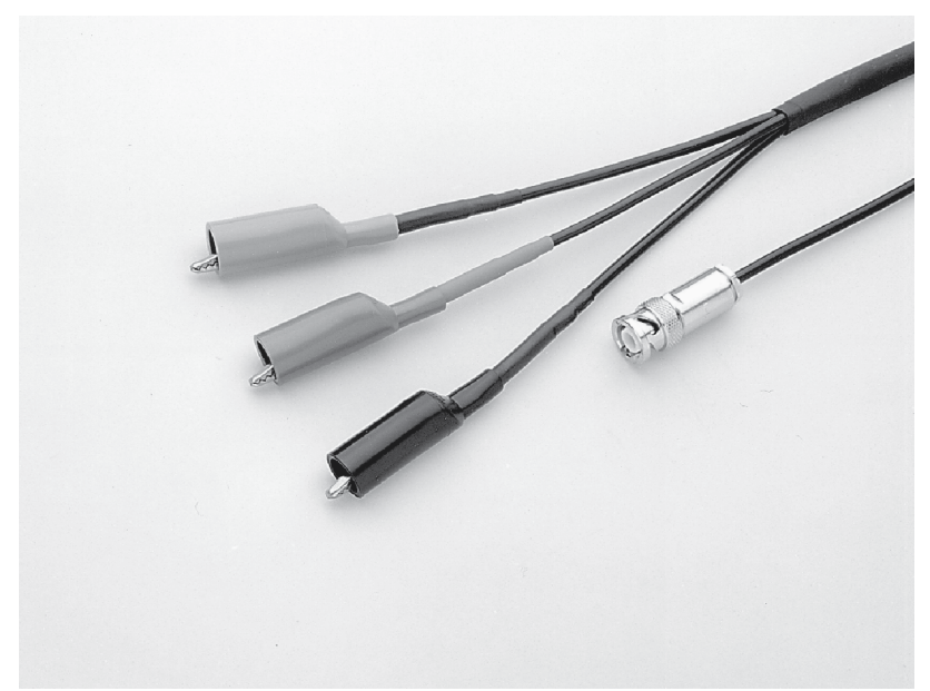
Figure 1: Model 237-ALG-2

The Keithley Instruments Model 237-ALG-2 is a 6.6 ft (2 m) triaxial cable that is terminated with a three-slot male triaxial connector on one end and alligator clips on the other end.