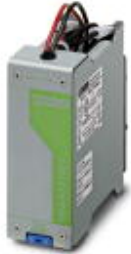
Energy storage device, lead AGM, VRLA technology, 24 V DC, 1.3 Ah.

Please be informed that the data shown in this PDF Document is generated from our Online Catalog. Please find the complete data in the user's documentation. Our General Terms of Use for Downloads are valid ( http://phoenixcontact.com/download )