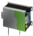
Energy storage device, lead AGM, VRLA technology, 24 V DC, 12 Ah. Connection via pin cable lug, 14 mm.

Energy storage - QUINT-BAT/24DC/12AH - 2866365