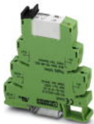
The figure shows a version with a screw connection

PLC-INTERFACE, consisting of PLC-BPT.../21 basic terminal block with Push-in connection and plug-in miniature relay with multi-layer contact, for mounting on NS 35/7,5 DIN rail, 2 PDTs, 24 V DC input voltage