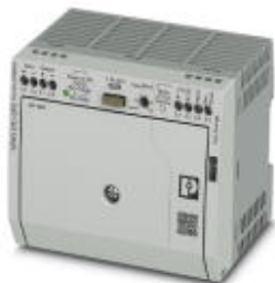
Uninterruptible energy supply with integrated energy storage, lead AGM, VRLA technology, 24 V DC, 0.8 Ah.

Please be informed that the data shown in this PDF Document is generated from our Online Catalog. Please find the complete data in the user's documentation. Our General Terms of Use for Downloads are valid ( http://phoenixcontact.com/download )