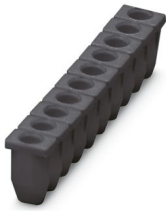
Insulating sleeve, color: black

https://www.phoenixcontact.com/pc/products/3002898