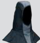
16 91 00