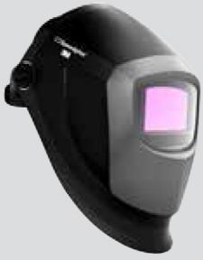
40 13 85