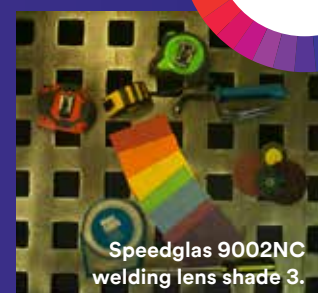
Speedglas 9002NC welding lens shade 3.