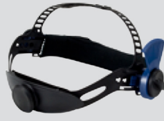
70 50 15