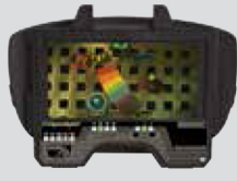
40 00 85