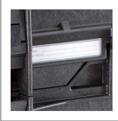
WRITABLE NAME TAG PVC waterproof ID removable label