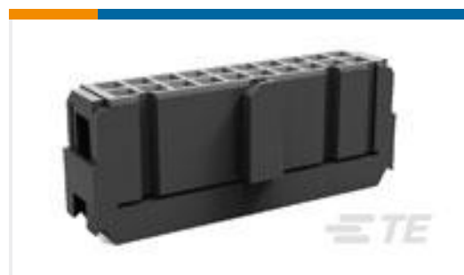
TE Part #1-1658621-1 60 NOVO MIL/CTR 15DP,LEAD FREE