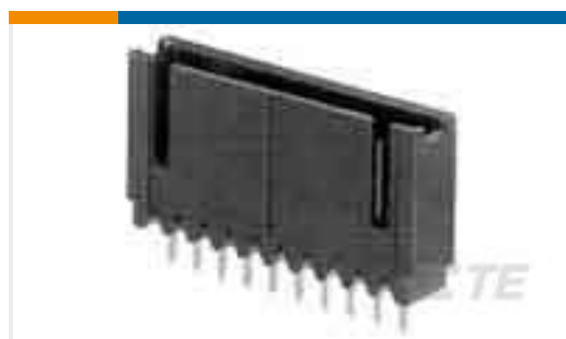
TE Part #5-103080-2 04 MODII HDR SRST SHRD .100CL