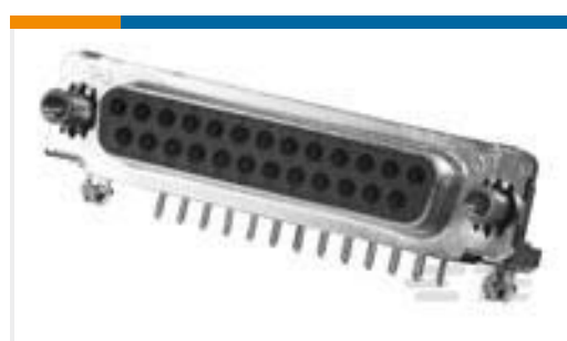
TE Part #5747844-5 09 MSFL RCPT RA 318 (SL,FM,BL)