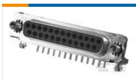
TE Part #5747846-5 25 MSFL RCPT RA 318 (SL,FM,BL)