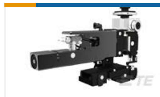
TE Part #2151515-2 OCEAN_2.0_Applicator-S-026F027F