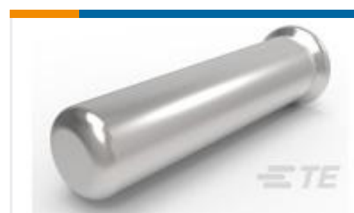
TE Part #50462-6 SOCKET,MIN-SPR AU SER-2