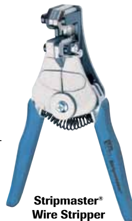
Stripmaster® Wire Stripper