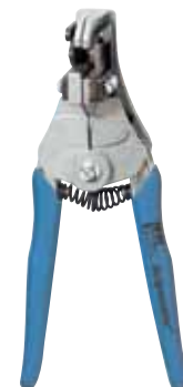
Stripmaster® Lite Wire Stripper