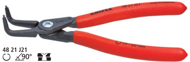
48 21 J21