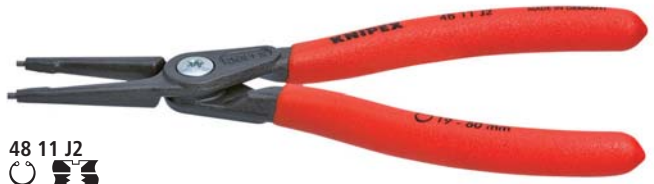
48 11 J2