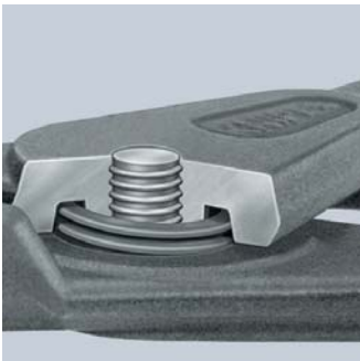
Spring inside the joint: the spring is protected inside the precisely bolted joint. It does not hinder work and cannot get dirty or lost

Easy and reliable assembly: form-fitting inserted and pressed-in tips made of high-density spring steel offer a high level of protection against excessive stress and strain, e.g. when removing stuck rings. The large supporting surfaces and the position of the tips make it more difficult for the rings to bounce off.