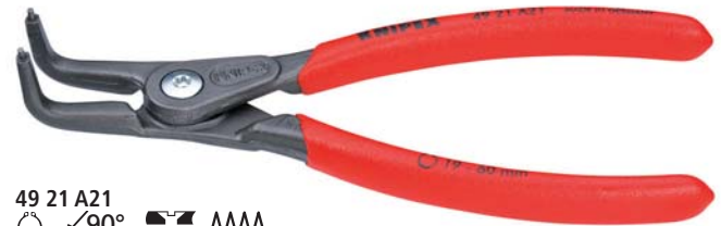
49 21 A21