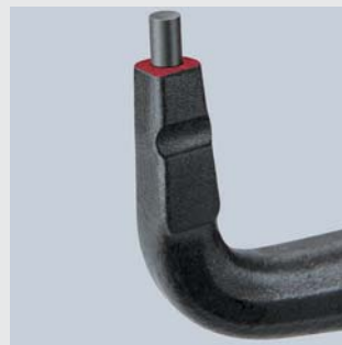
Sturdy, inserted tips: made from high-density spring steel

High-density spring steel with a score-free surface is used for the tips. This increases the tips' resistance to dynamic and static strain. The tips are 30 % more stable than conventional pliers when subjected to one-off overloading while still allowing good accessibility during assembly. Subjected to dynamic strain, the tips' resistance capacity is up to 10 times greater! The tips on the precision circlip pliers are non-detachable!