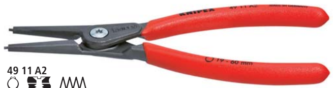
49 11 A2