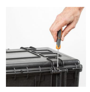
LID CAN BE SET SLIDE-OFF

By releasing the back screw, lid becomes set to slide-off when opened at 70^{\circ}