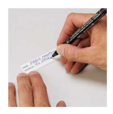
PVC WATERPROOF I. D. REMOVABLE LABEL (Art. LABELCOVER + nr. art.)