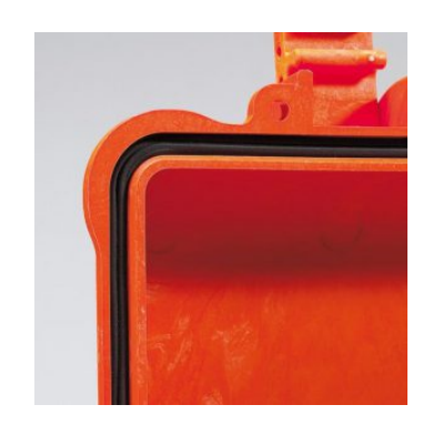
SEALING O-RING (Art. NEOSEAL + nr. art.)

Internal slots for optional panel mounting brackets or panel mounting rings