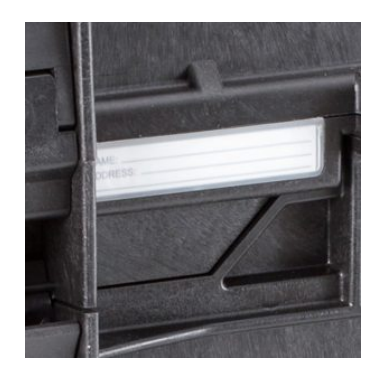
WRITABLE NAME TAG PVC waterproof ID removable label