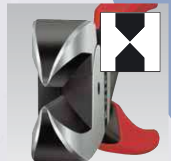
The cutting edges are in the center of the cutter head