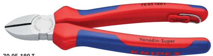
70 05 180 T