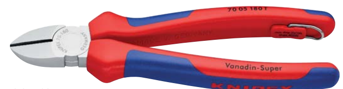
70 05 180 T