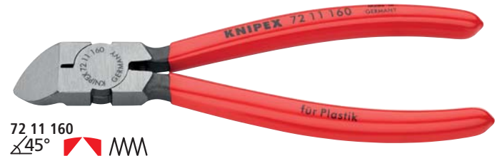
72 11 160 ∠45° MM