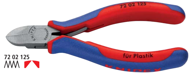
72 02 125 MM