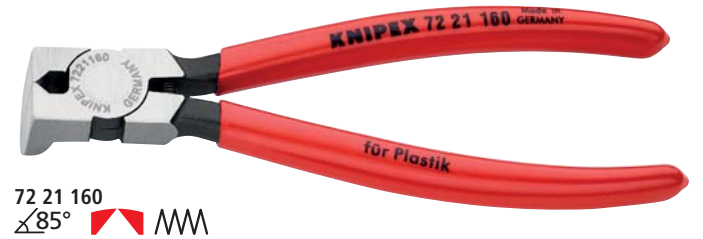
72 21 160 ∠85° MM