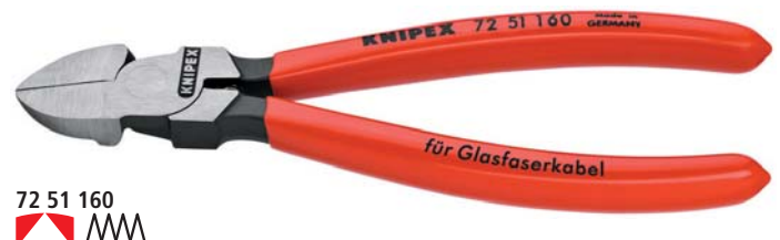
72 51 160 MM