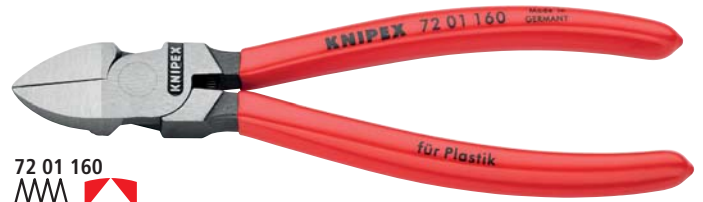
72 01 160 MM