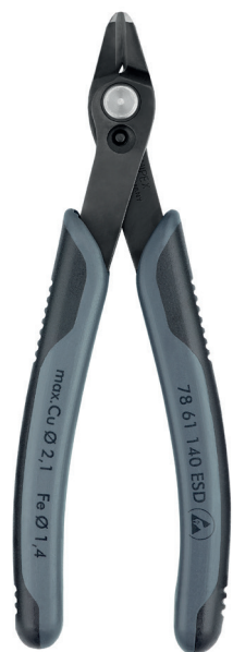
78 61 140 ESD