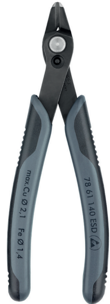
78 61 140 ESD