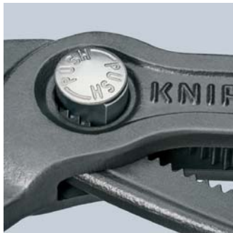
Fine adjustment by pushing a button: fast and comfortable

Pliers with tether attachment point for mounting a fall protection