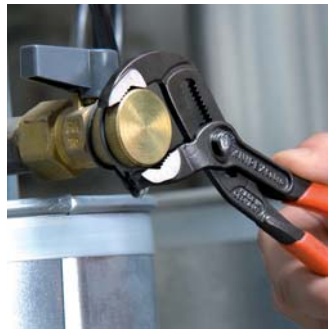
Fast and firm adjustment directly on the workpiece