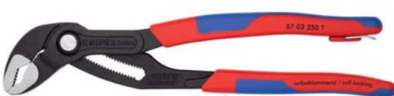
87 02 250 T