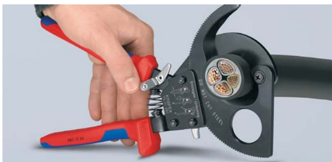
95 31 250/280: fixed handle with support area as an aid to position the cutters on a flat surface