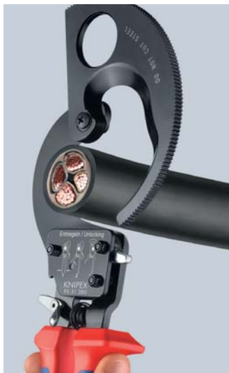
95 31 280: Large cutting capacity: max. 52 mm dia. / 380 mm 2

suitable for aluminium sector cable up to 4 x 150 mm 2