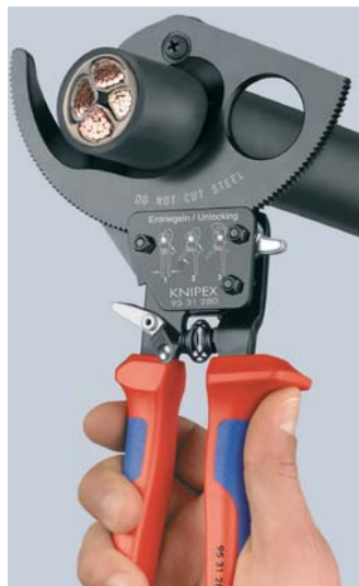
Ratchet principle and two-stage ratchet drive for easier cutting