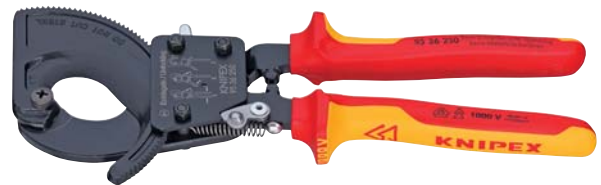
95 36 250 ⚡ 1000V ⚡ M M