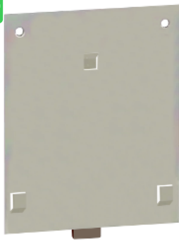
plate for mounting on symmetrical DIN rail - for voltage transformer