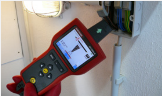
Trace energized or de-energized wires by removing the junction box cover.