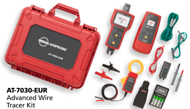
AT-7030-EUR Advanced Wire Tracer Kit