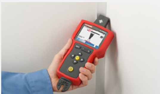
Use the Tip Sensor to trace wires in hard to reach areas.

The SC-7000-EUR signal clamp accessory can be used with the AT-7000-TE Transmitter to induce a signal into energized and de-energized wires when there is no access to bare conductors. Simply clamp around the desired wire to induce the signal, then begin tracing.