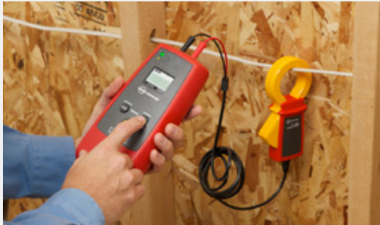
Induce signal with the signal clamp when there is no bare conductor.

Trace energized and de-energized wires enclosed in metal conduit by removing the junction box cover and using the AT-7000-RE Receiver's Tip Sensor to identify the specific wire carrying the transmitted signal generated by the AT-7000-TE Transmitter. Wires in non-metal conduit can be traced directly without opening the junction box and using the AT-7000-RE Receiver's Smart Sensor™.