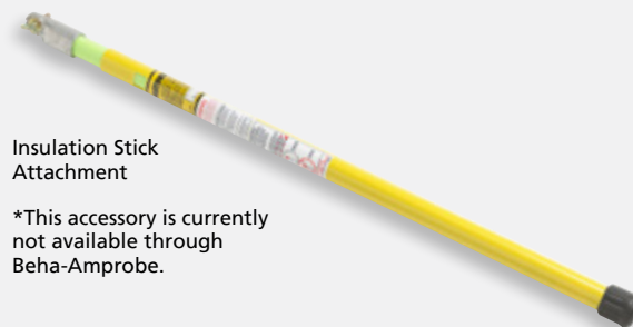
Insulation Stick Attachment

A standard insulation stick can be attached to the AT-7000-RE Receiver to easily trace wires in high ceilings, walls, and along floors. The stick can be purchased from electrical distributors.*