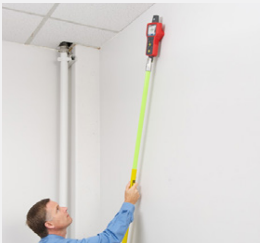
Trace wires in hard to reach places with insulation stick.

The NCV feature extends functionality of the AT-7000-RE Receiver by detecting energized wires from 90 to 600 V and 40 to 400 Hz without the use of the AT-7000-TE Transmitter. Its adjustable sensitivity fits a range of applications, from detecting presence of voltage (higher sensitivity) to precisely pinpointing a hot wire in a bundle (lower sensitivity).