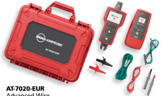
AT-7020-EUR Advanced Wire Tracer Kit