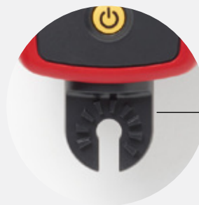
AT-8000-R universal attachment bracket for AT-410 Hot Stick attachment.