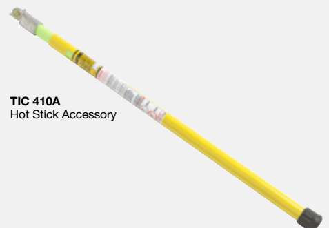
TIC 410A Hot Stick Accessory