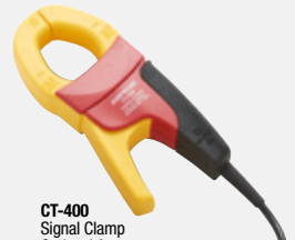
CT-400 Signal Clamp Optional Accessory