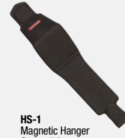
HS-1 Magnetic Hanger Optional Accessory