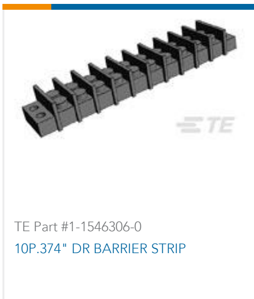
TE Part #1-1546306-0 10P.374" DR BARRIER STRIP