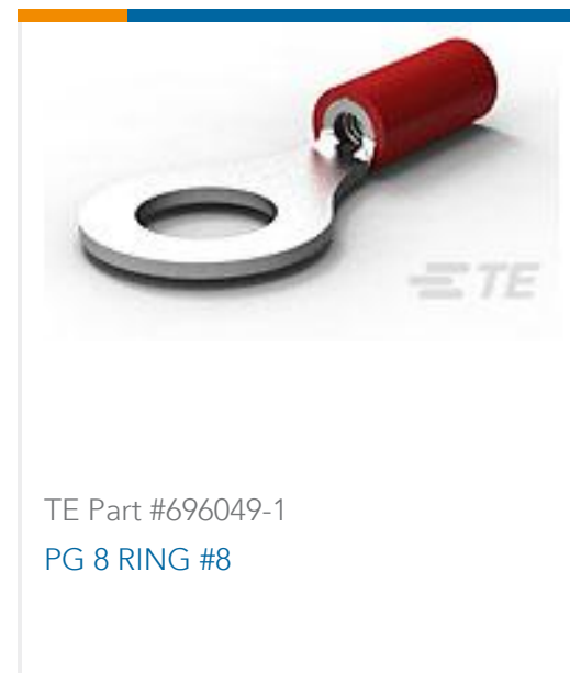
TE Part #696049-1 PG 8 RING #8