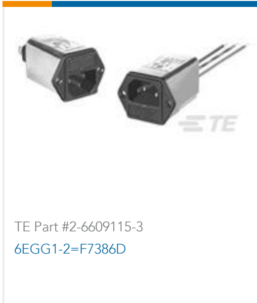
TE Part #2-6609115-3 6EGG1-2=F7386D