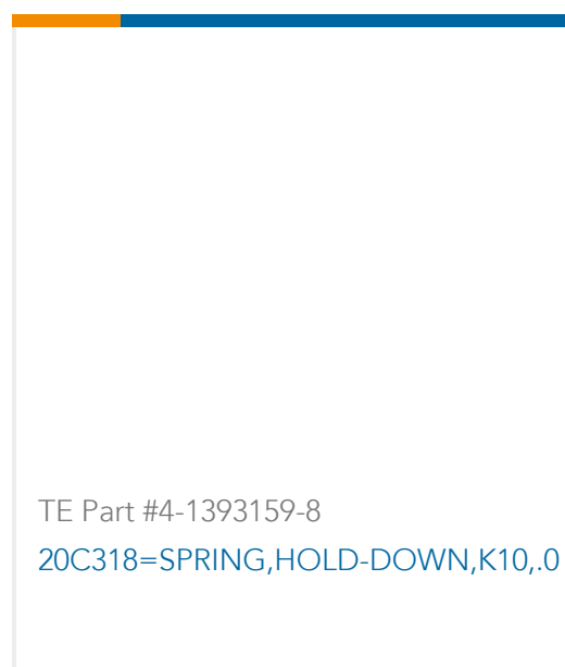
TE Part #4-1393159-8 20C318=SPRING,HOLD-DOWN,K10,.0