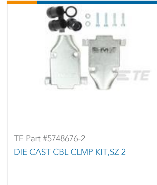
TE Part #5748676-2 DIE CAST CBL CLMP KIT,SZ 2