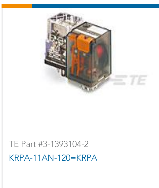
TE Part #3-1393104-2 KRPA-11AN-120=KRPA