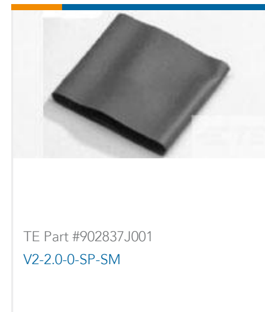
TE Part #902837J001 V2-2.0-0-SP-SM