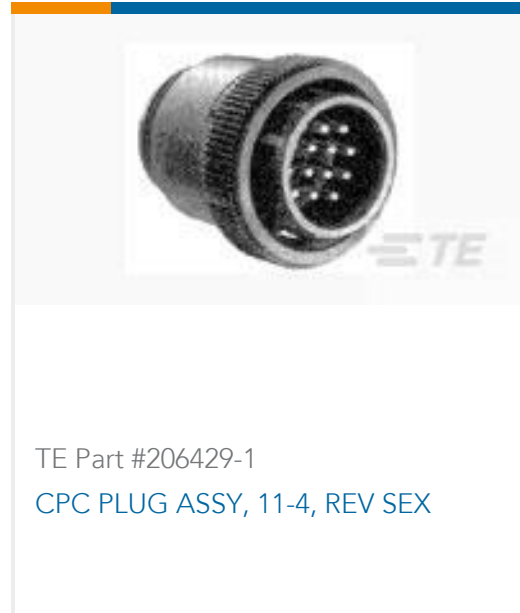
TE Part #206429-1 CPC PLUG ASSY, 11-4, REV SEX