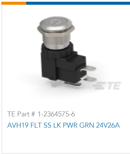
TE Part # 1-2364575-6 AVH19 FLT SS LK PWR GRN 24V26A