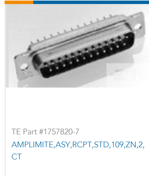
TE Part #1757820-7 AMPLIMITE,ASY,RCPT,STD,109,ZN,2,CT