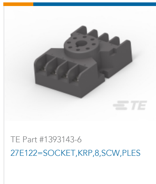
TE Part #1393143-6 27E122=SOCKET,KRP,8,SCW,PLES