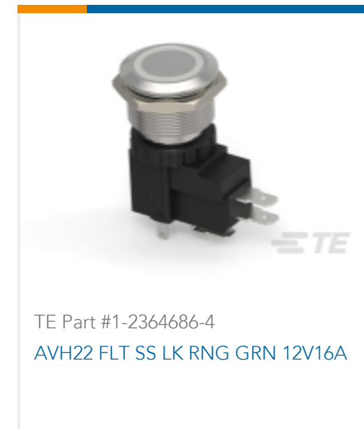
TE Part #1-2364686-4 AVH22 FLT SS LK RNG GRN 12V16A