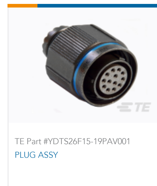
TE Part #YDTS26F15-19PAV001 PLUG ASSY