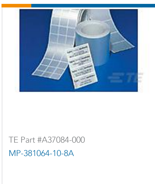
TE Part #A37084-000 MP-381064-10-8A