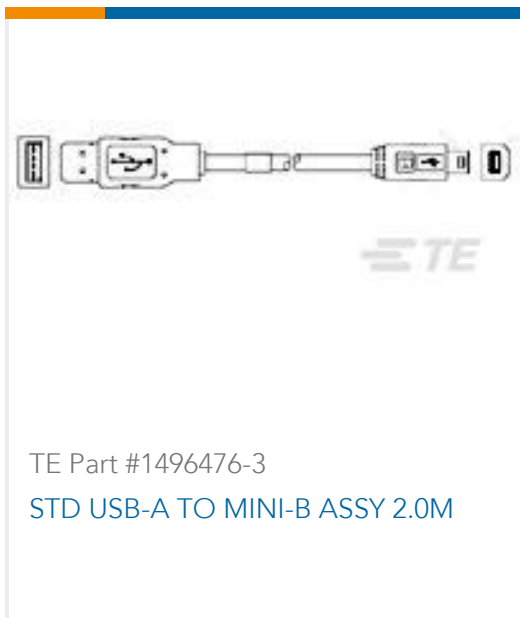
TE Part #1496476-3 STD USB-A TO MINI-B ASSY 2.0M