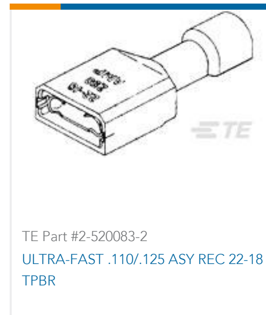
TE Part #2-520083-2 ULTRA-FAST .110/.125 ASY REC 22-18 TPBR