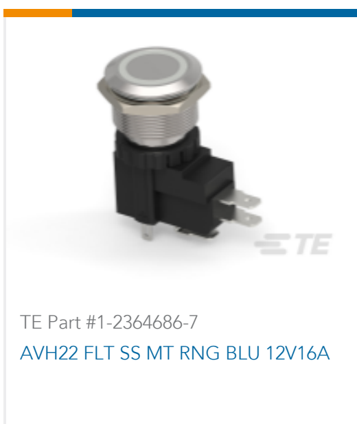
TE Part #1-2364686-7 AVH22 FLT SS MT RNG BLU 12V16A