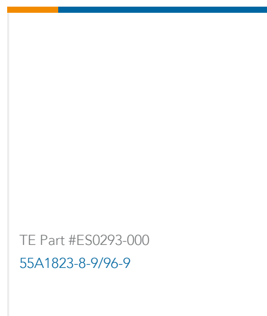
TE Part #ES0293-000 55A1823-8-9/96-9