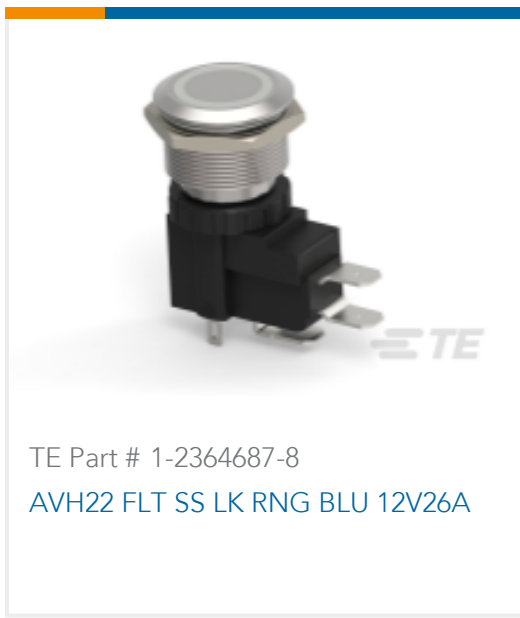
TE Part # 1-2364687-8 AVH22 FLT SS LK RNG BLU 12V26A