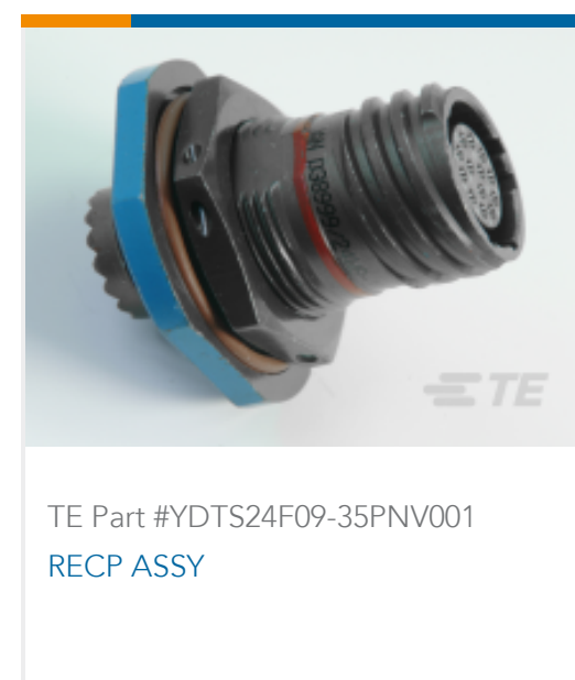
TE Part #YDTS24F09-35PNV001 RECP ASSY