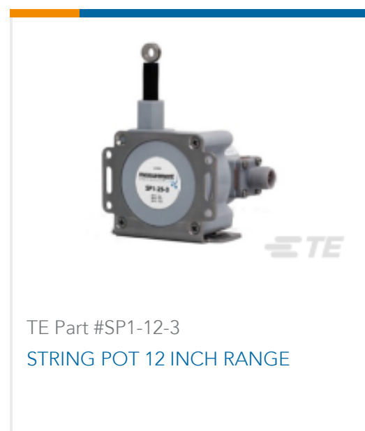
TE Part #SP1-12-3 STRING POT 12 INCH RANGE