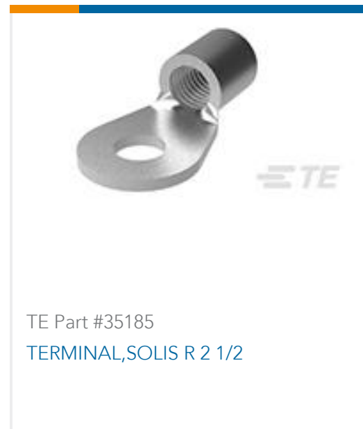
TE Part #35185 TERMINAL,SOLIS R 2 1/2