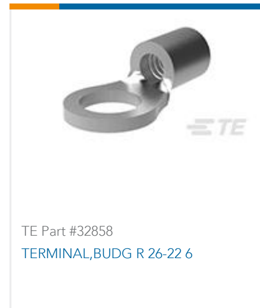
TE Part #32858 TERMINAL,BUDG R 26-22 6