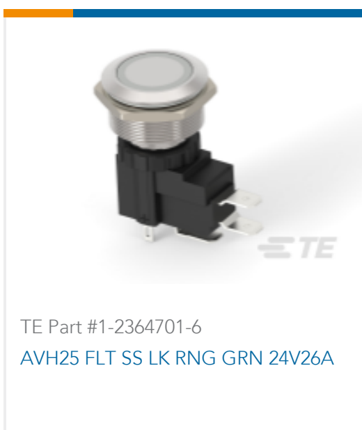
TE Part #1-2364701-6 AVH25 FLT SS LK RNG GRN 24V26A