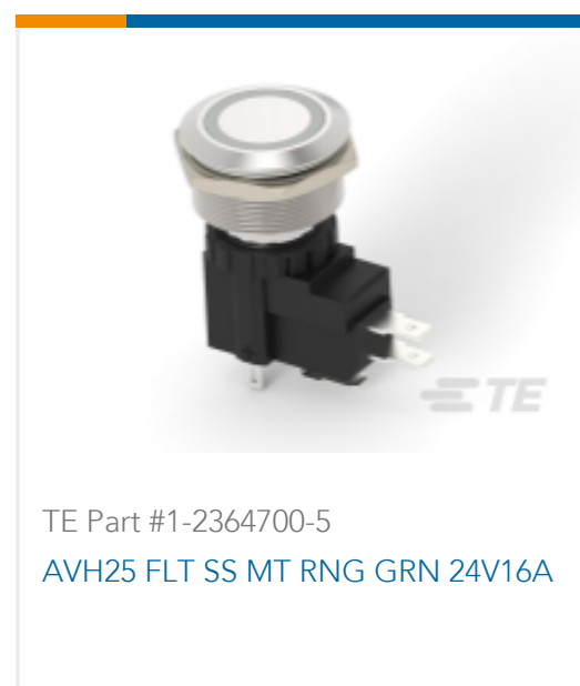
TE Part #1-2364700-5 AVH25 FLT SS MT RNG GRN 24V16A