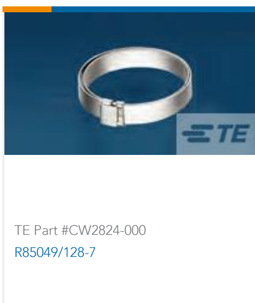
TE Part #CW2824-000 R85049/128-7