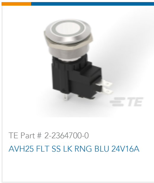
TE Part # 2-2364700-0 AVH25 FLT SS LK RNG BLU 24V16A