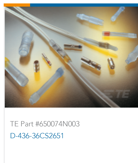
TE Part #650074N003 D-436-36CS2651