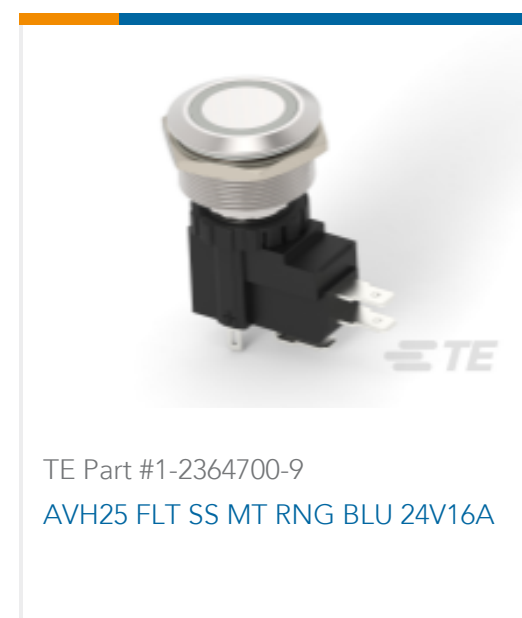
TE Part #1-2364700-9 AVH25 FLT SS MT RNG BLU 24V16A