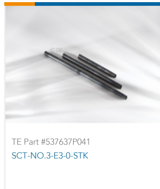
TE Part #537637P041 SCT-NO.3-E3-0-STK