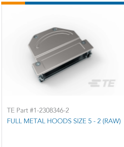
TE Part #1-2308346-2 FULL METAL HOODS SIZE 5 - 2 (RAW)