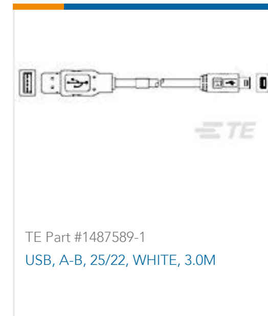
TE Part #1487589-1 USB, A-B, 25/22, WHITE, 3.0M