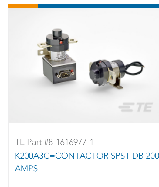
TE Part #8-1616977-1 K200A3C=CONTACTOR SPST DB 200 AMPS