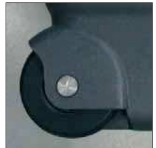
• Wheels on ball bearing

• Bottom area has removable dividers fixed directly on the shell body with no need of additional tray. Lightweight and higher load capacity are ensured.