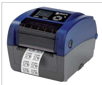
Step 3: Print