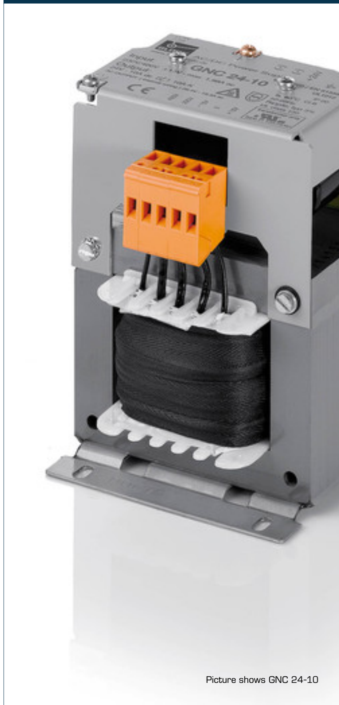
Picture shows GNC 24-10