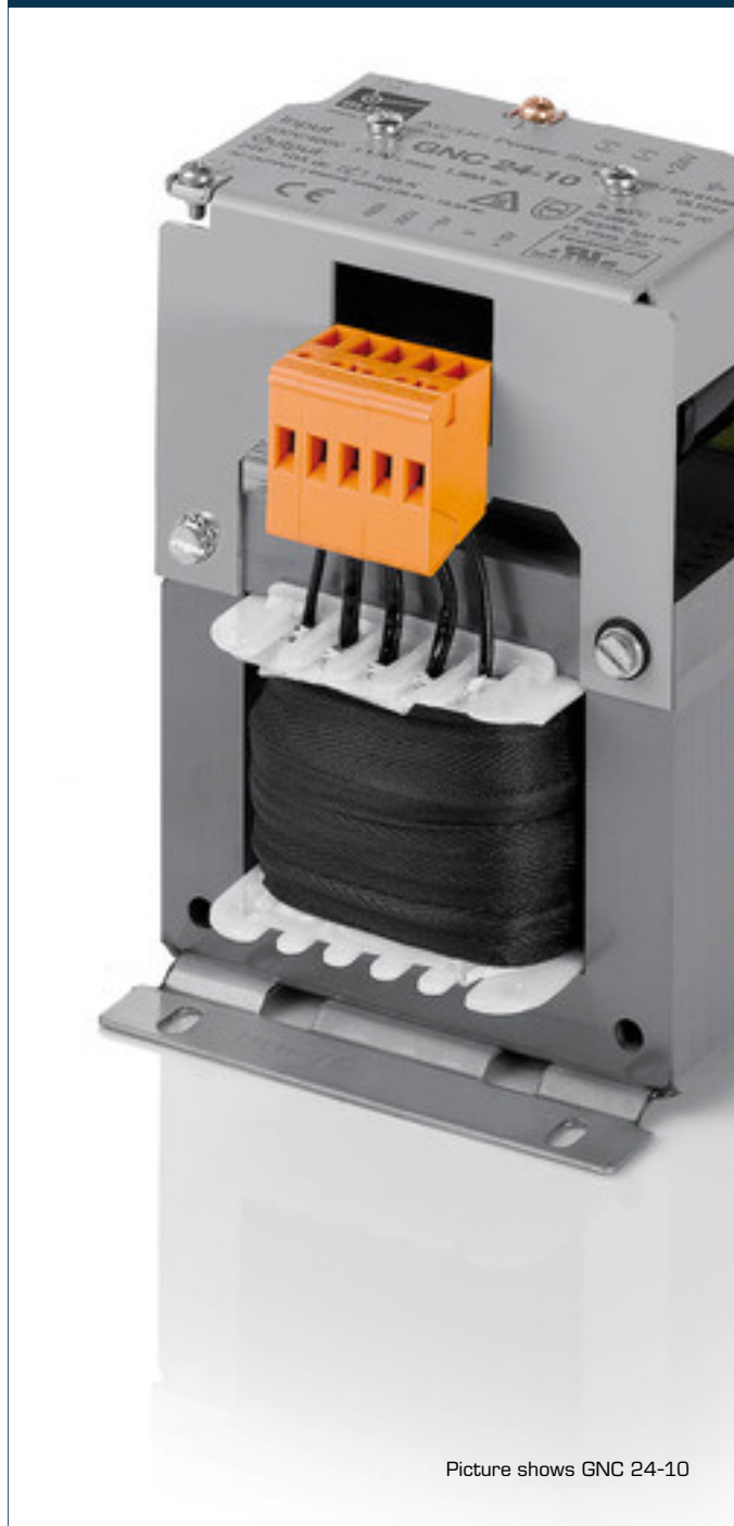
Picture shows GNC 24-10