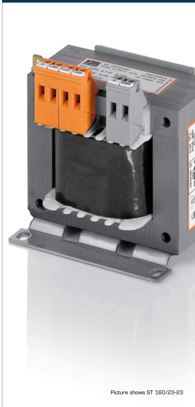
Picture shows ST 160/23-23