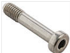
Allen cheese-head screw for lid