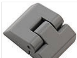
Set of hinges