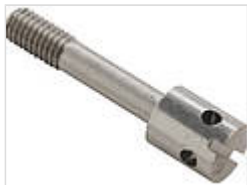
Capstan-headed screws, sealable