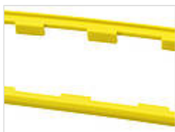
Seals, rape yellow