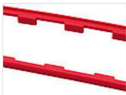
Seals, fire red