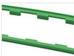
Seals, patina green