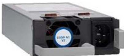
Figure 14. 650W AC power supply