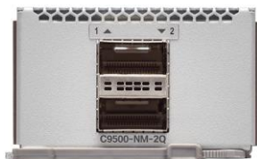
Figure 11. Cisco Catalyst 9500 Series network module 2-port 40 Gigabit Ethernet with QSFP+