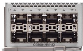
Figure 10. Cisco Catalyst 9500 Series network module 8-port 1/10 Gigabit Ethernet with SFP/SFP+

Figures 9 and 10 show the available network modules