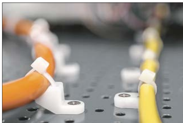
LKM, CL8 and FH cable tie mounts for applications with limited space.