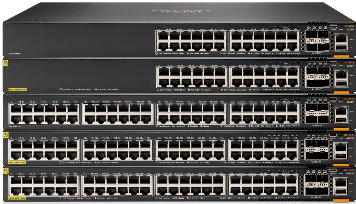
Aruba CX 6200F Switch Series

Aruba Dynamic Segmentation extends Aruba's foundational wireless role-based policy capability to Aruba wired switches. What this means is that the same security, user experience and simplified IT management can be enjoyed throughout the network. Regardless of how users and IoT devices connect, consistent policies are enforced across wired and wireless networks, keeping traffic secure and separate.