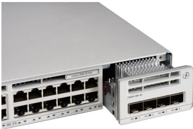
Figure 3. Cisco Catalyst 9200 Series Switch dual redundant power supplies