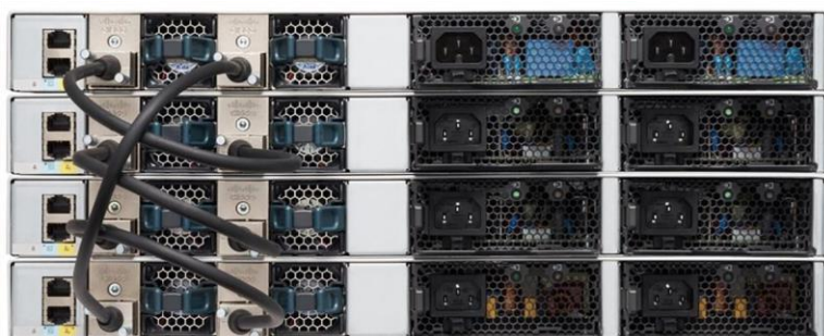
Figure 4. Cisco Catalyst 9200 Series Switch stacked units