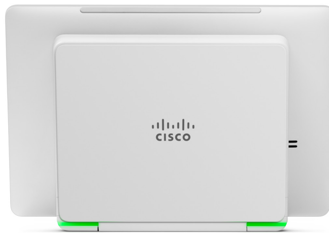
Above: Rear view of the Room Navigator

Table 1 gives specifications of the Webex Room Navigator device.