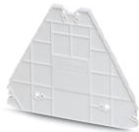
End cover, Length: 100 mm, Width: 3.8 mm, Height: 80.8 mm, Color: white

Please be informed that the data shown in this PDF Document is generated from our Online Catalog. Please find the complete data in the user's documentation. Our General Terms of Use for Downloads are valid ( http://phoenixcontact.com/download )